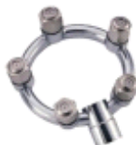
5-HOLE RIONG NOZZLE P-8