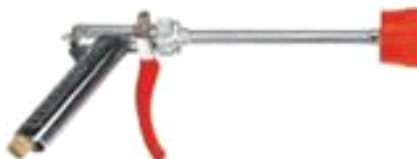
HORN SPRAY GUN P-6