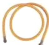
High Pressure hose P-10