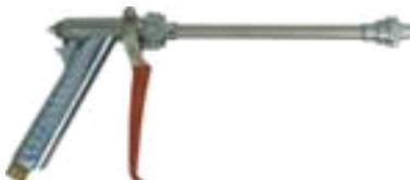
CONE SPRAY GUN P-7