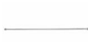
Spray Rod P-14